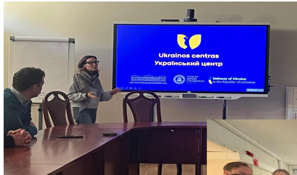
Study visit to Vilnius (7-9 October 2024)