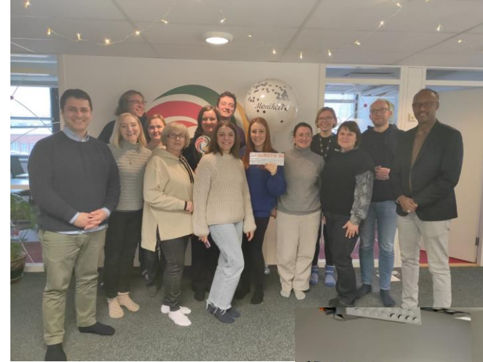
Study visit to Helsinki (11-15 December 2023)