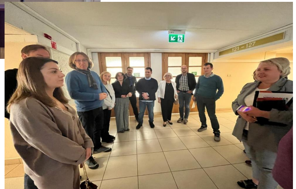
Study visit to Katowice (16-18 September 2024)