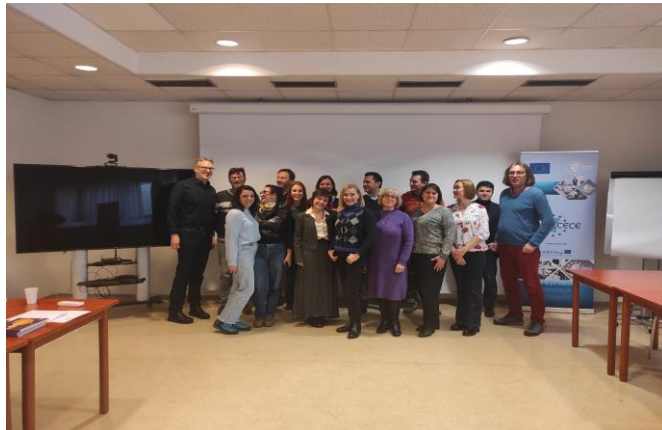
Study visit to Klagenfurt (5-9 February 2024)