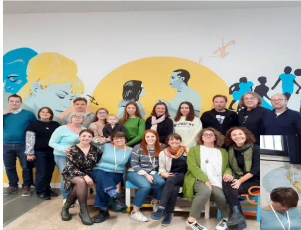
Study visit to Padua (17-19 October 2023)